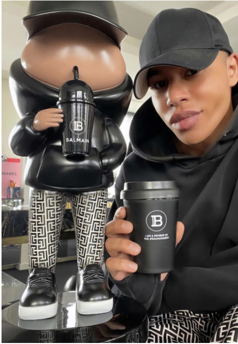
Olivier Rousteing (Balmain)