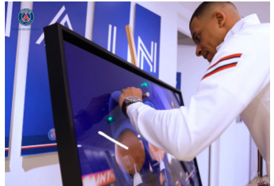
Kyllian Mbappé (Paris Saint-Germain)