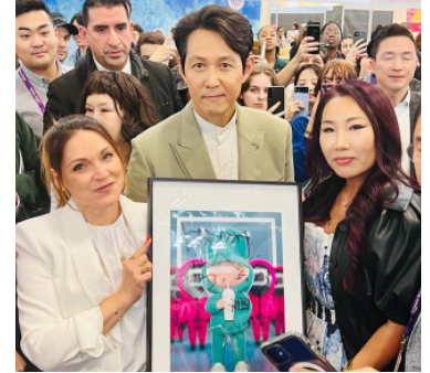
Lee Jung-jae (Squid Game)