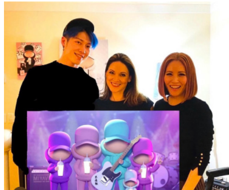
Miyavi & Melody